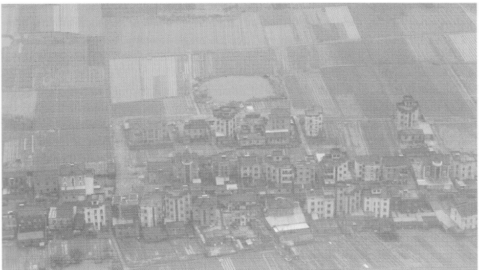
Picture 1. The 'rural' area around Hangzhou city

I took the photo below on 9 March 2010 around noon, just before landing at the airport of Hangzhou. I hardly believed my eyes: why were so many multi-storey houses built in this obviously agricultural area?