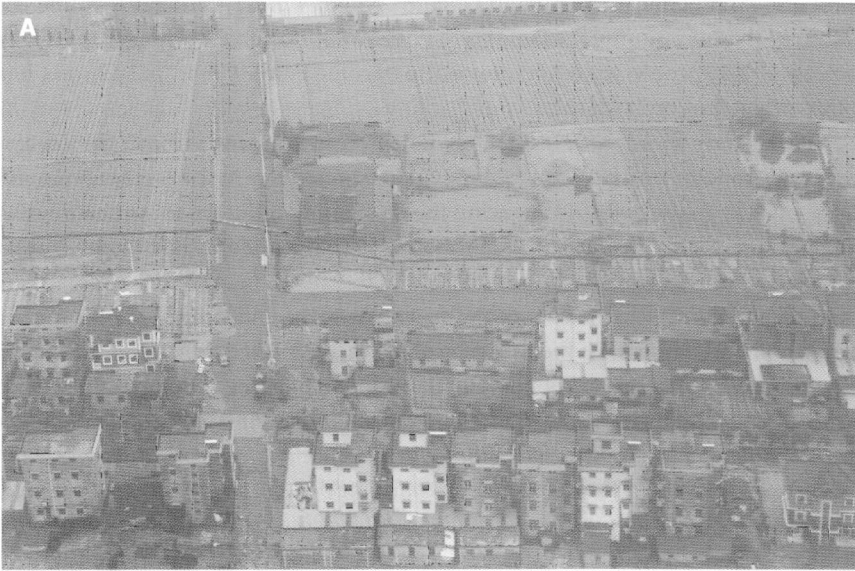
Pictures 2. Unplanned, spontaneous urbanisation of rural areas: farmers are extending their houses to be able to accommodate migrant workers in private rental flats: A) two rural houses can be seen still in their original shape, before densification