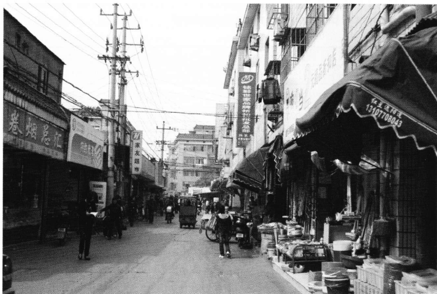
Pictures 3. The traditional Chinese urban structures are threatened to be demolished and replaced by residential skyscrapers (pictures taken in Hangzhou)